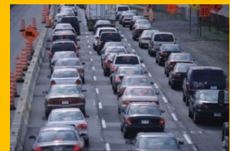
Removing emissions of 5 cars