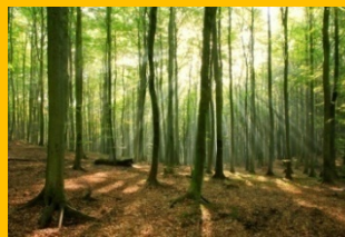
Equal to 6 acres forest

5 kW InnovaGen: saves 47,100 kWh/y Total CO2 reduced per year = 30 tons